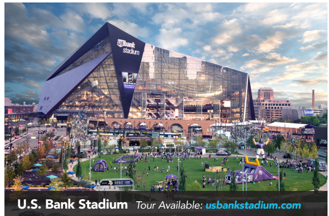
U.S. Bank Stadium Tour Available: usbankstadium.com