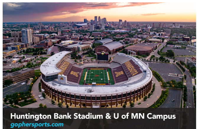
Huntington Bank Stadium & U of MN Campus gophersports.com