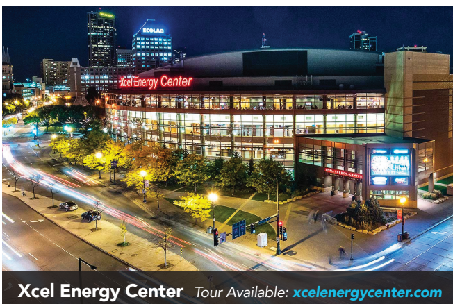
Xcel Energy Center Tour Available: xcelenergycenter.com