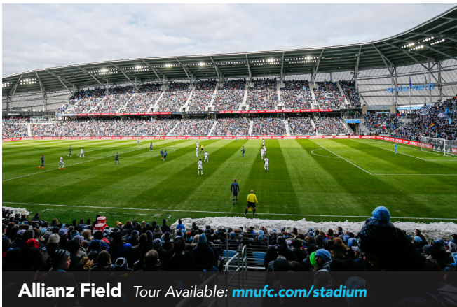
Allianz Field Tour Available: mnufc.com/stadium