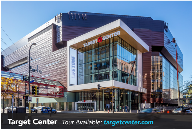
Target Center Tour Available: targetcenter.com